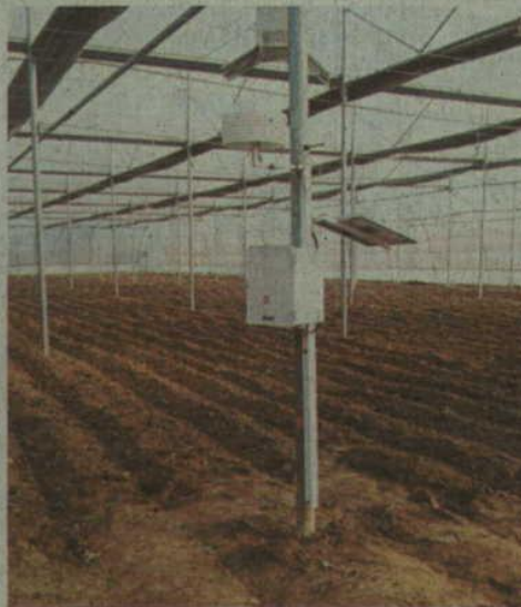
In season An automatic weather station at a potato farm in West Bengal

The farmers are paying us for specialised data on soil, weather and rainfall, as well as for providing access to credit and insurance and supply chains